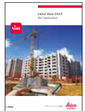
Leica Viva GS15